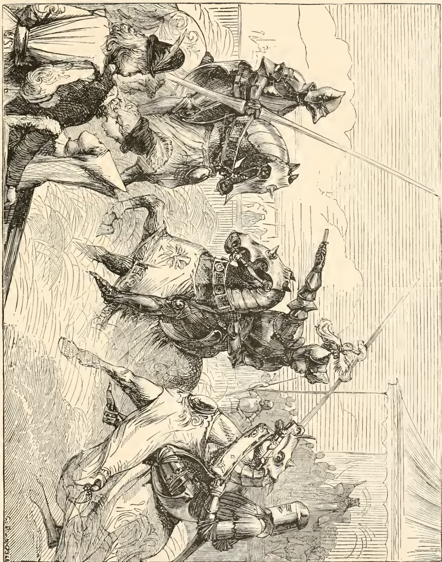
THE COMBAT. — Page 28.